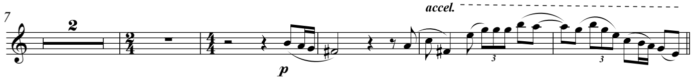
Table of brotherhood (♩=74)